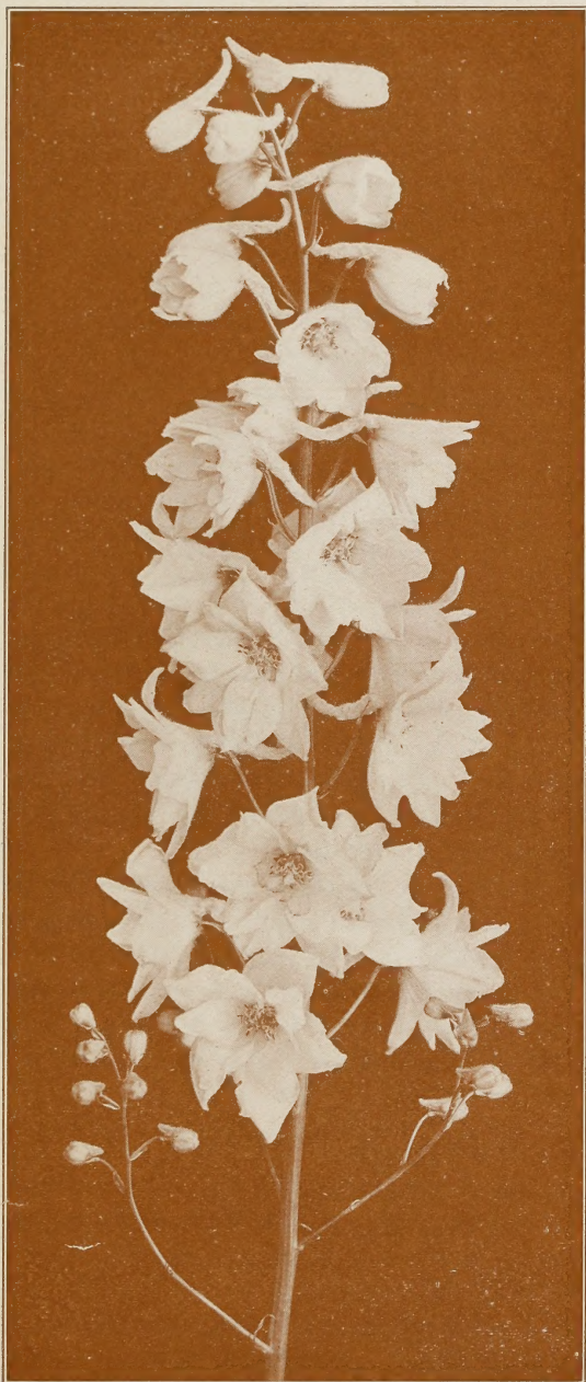
The Improved Larkspur.

It is very rare that a fruit variety of any kind will thrive under all conditions of soil, climate and locality. No fruit thrives equally well in all parts of the United States even. Two or three of the ancient European and early American standards approach this cosmopolitan tendency. The old Bartlett pear thrives fairly perhaps in half the States of the Union, the Ben Davis and the Rhode Island Greening apples thrive over a large territory, perhaps including nearly one-third the United States, though their usefulness as standard varieties is very much more limited.